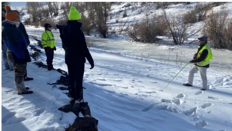
Damage survey reports were conducted in February 2021.

Postfire hazards may include but are not limited to: stream channels becoming clogged with sediment and debris which may result in flooding; infrastructure such as roads and bridges becoming damaged by increased sediment and debris during runoff; and homes and or other structures that could be impacted by increased water and debris flows. Because of the effects of the fire on the landscape, ephemeral channels might emerge where water has not historically flowed. The assessment teams are working with NRCS to summarize the data and prepare Damage Survey Reports which will be submitted to NRCS national headquarters for funding consideration and possible approval.