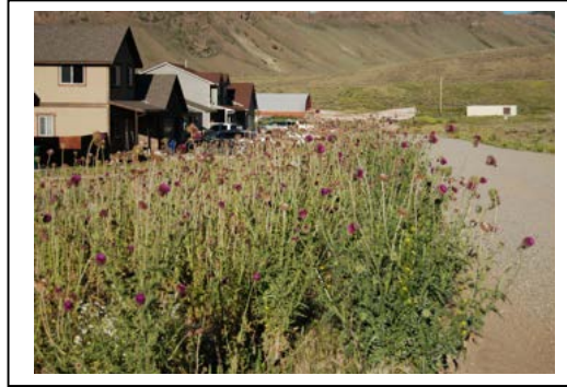
Canada , Musk, and Bull thistle

The most common noxious weeds in Hot Sulphur Springs are these.